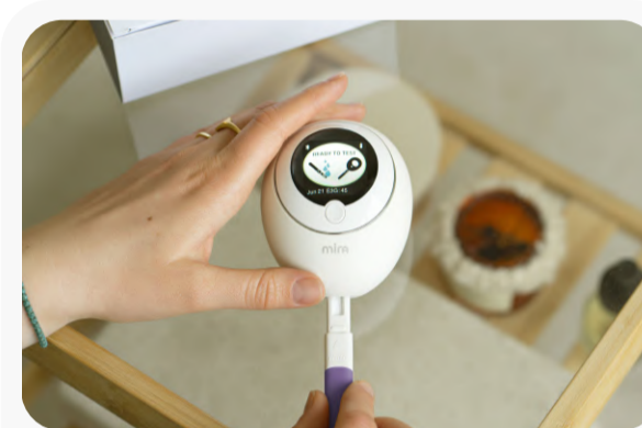
Step 2 Insert the wand into the Mira Analyzer.