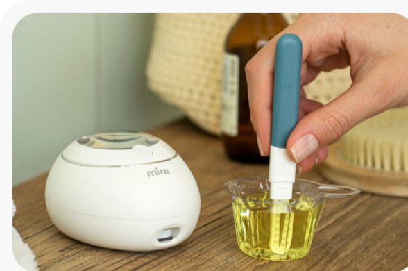
Step 1 Dip the test wand into urine for 20 seconds.

The Mira App's advanced algorithm provides accurate and personalized information about your cycle, hormone levels, and fertile window.